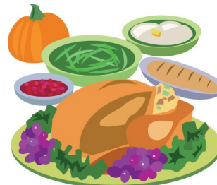
A Feast of Gratitude

is to have turkey, dressing, and all the trimmings. We are counting on everyone working together to make this a great time of fellowship and thanksgiving. There is a sign up sheet on the Bulletin Board for us as well as one in the FLC for the Friday "Nights" to sign up.